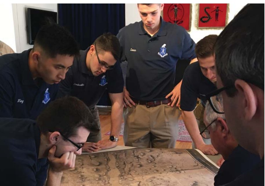
Fordham ROTC participants exmine a map of the Battle of Brooklyn.