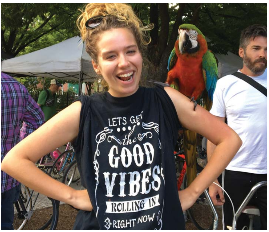
Neighbors at the Bike Jumble.