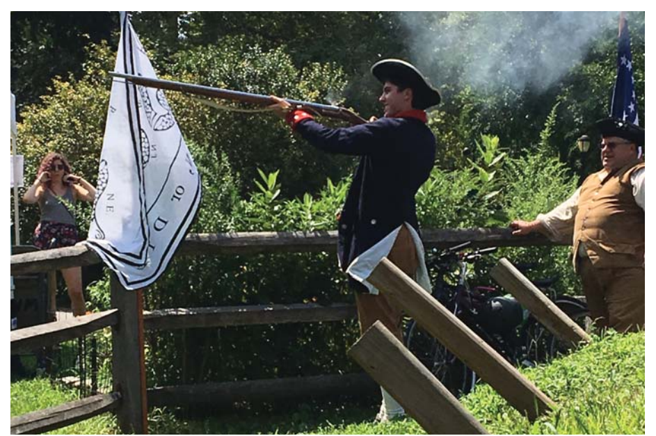
Battle Week Reenactors.