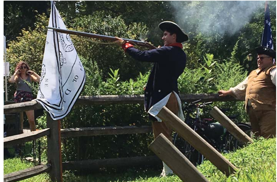
Battle Week Reenactors.