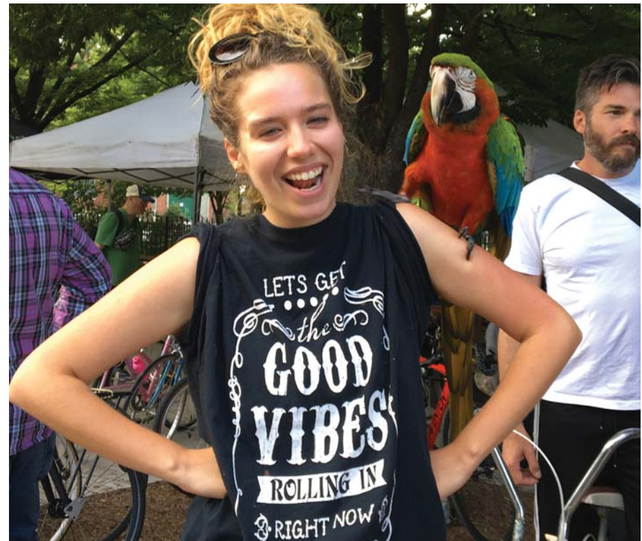
Neighbors at the Bike Jumble.