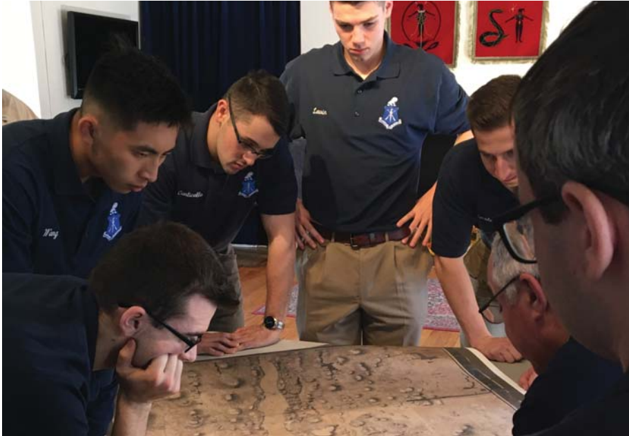
Fordham ROTC participants examine a map of the Battle of Brooklyn.